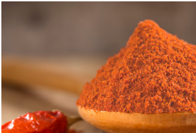
45 ASTA SS & IRR

Available in cases, co-packed, or blended to fit certain applications.