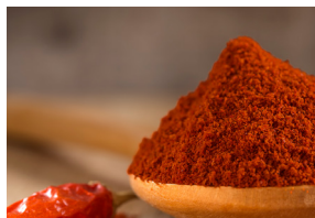
90 ASTA SS & IRR