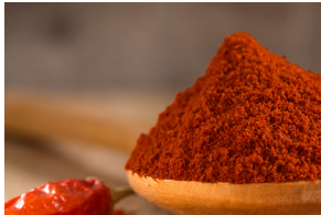
85 ASTA SS & IRR