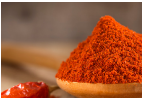
110 ASTA SS & IRR