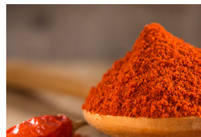
100 ASTA SS & IRR